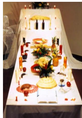
The Ceremonial Table

We are inviting you to partner with us to present this event by authorizing your name and/or logo to be added to our program and promotional materials, and by participation in the development and implementation of the project. Please see the list that follows.